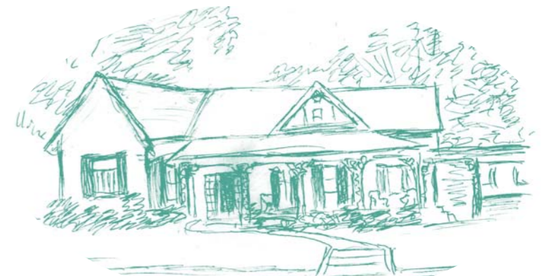
The Anderson Home 706 North Main Street