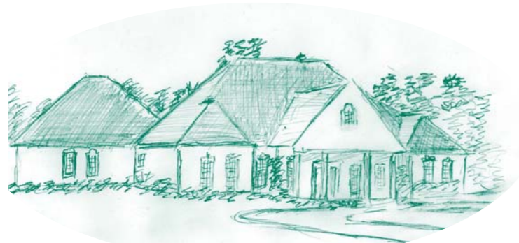
The Watts Home 252 Arlington Drive