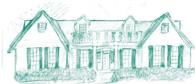
The Willis Home 707 North Main Street