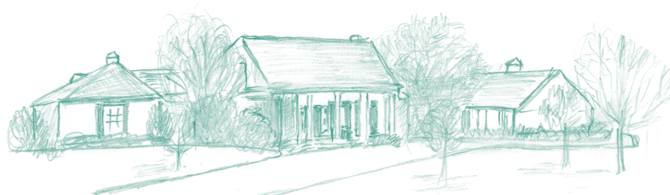
The Weaver Home 400 Arlington Drive