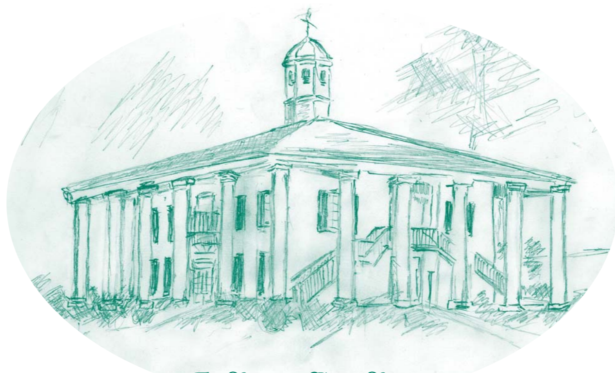
The Claiborne Parish Courthouse On the Square in Homer